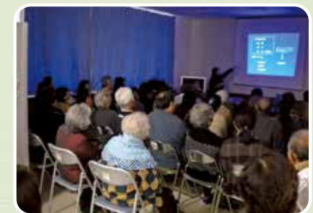
Food Sanitation Act Classes by the Hokubu Regional Public Health Center

In addition to the above classes and services, we offer many more culture classes, Experience Programs Guide training sessions, information sessions about obtaining approval by the Hotel Business Law and Fire Services Act, as well as other kinds of workshops and classes.