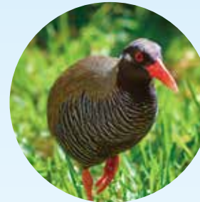
Yanbaru Kuina (Okinawa Rail)