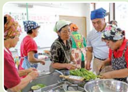
Okinawan Cuisine Workshops