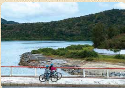
A6 Cycling Experience