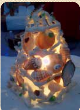
C4 Seashell Lampshade Making Experience