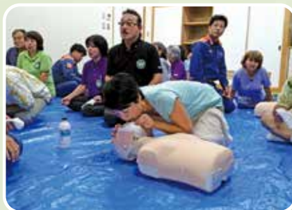
Emergency and Critical Care Training Courses