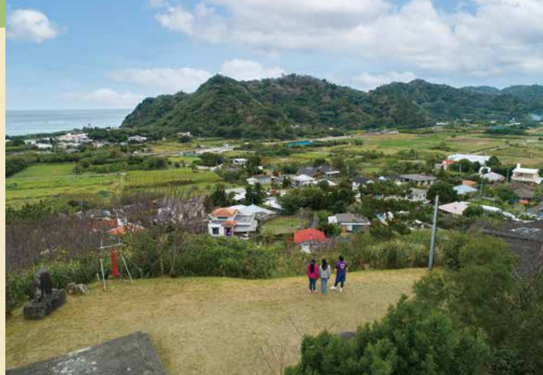
(Kijoka Himba Forest)

Yanbaru is a registered World Natural Heritage site located in the northern part of the main island of Okinawa. In Ogimi Village, which is the entrance to the area, which consists of three villages, a diverse group of plants that are internationally acclaimed, and the culture that remains. Learn the wisdom and thoughts of the elders that live in the village.