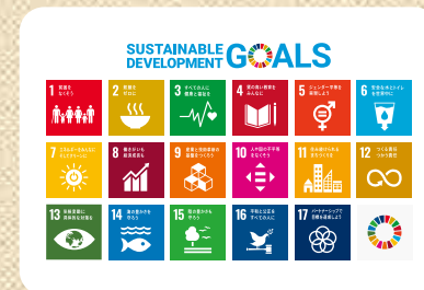
C7 Environmental Conservation Learning