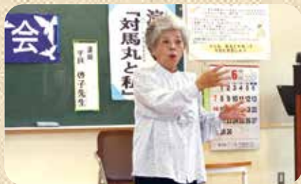
C1 Peace Learning