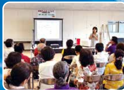
Allergy Prevention Class

The items listed above are just some of our workshops and training classes.