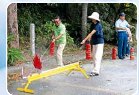
Fire Extinguishing Training