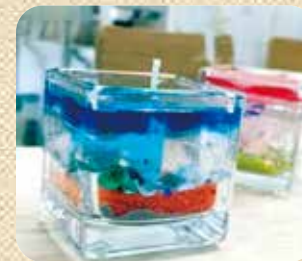
C6 Gel Candle Making Experience