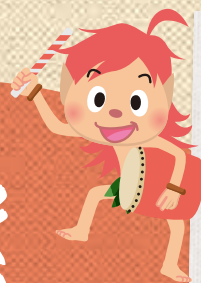
C2 Eisa Performance