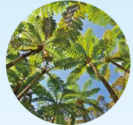
Hego Primeval Forest