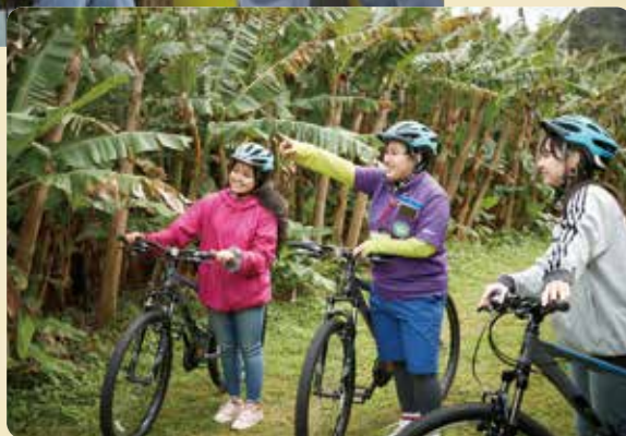
(Ito Basho Field)