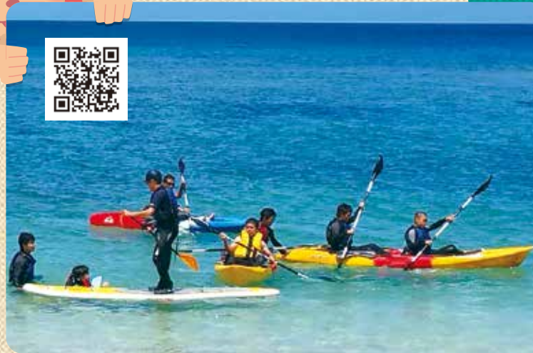
Marine Experience Program #2 Sea Kayaking/SUP