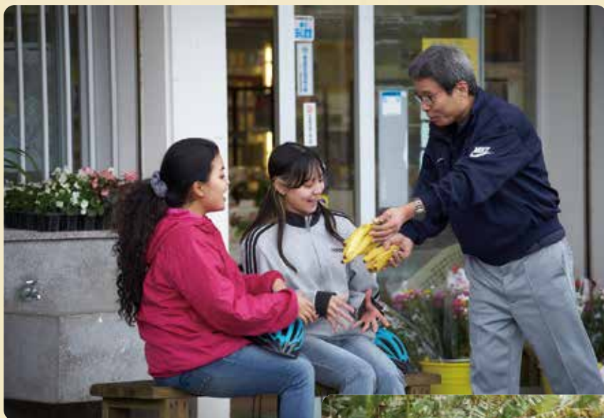
(Kijoka Local Market)