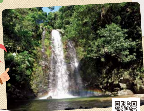
A1 Ta Waterfall Trekking & Playing Around the Basin