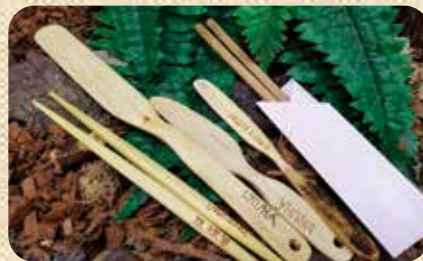
C5 Shikuwasa Wood Chopsticks and Spatula Making Experience