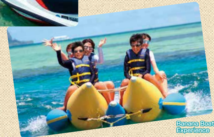
Banana Boat Experience