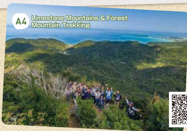
A4 Limestone Mountains & Forest Mountain Trekking